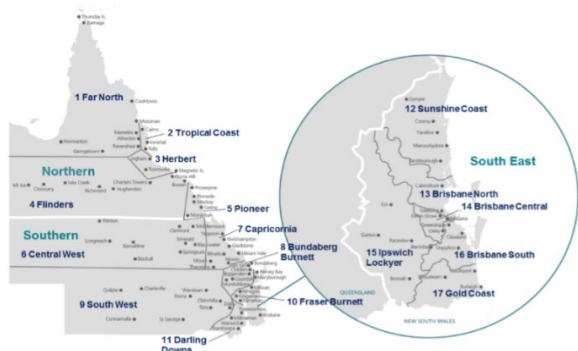
Image – Ergon Energy Network and Energex Operational Regions and Areas

Ergon Energy Network and Energex are responsible for the provision of electricity from the NSW and NT border up to the Torres Strait. It has 124 depots located across 17 operational areas to provide fault response and planning and maintenance activities for the electrical infrastructure.